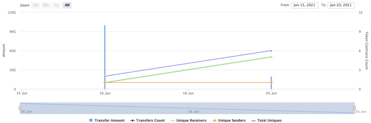
Token Contract 0x18a3AE686dc0e5D78e061038Ce12007c791665f2 (MooniWar) Source: BscScan.com